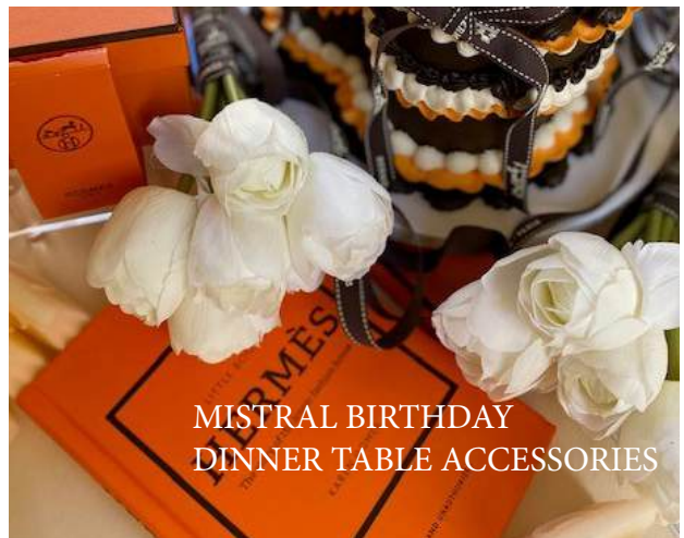
MISTRAL BIRTHDAY DINNER TABLE ACCESSORIES