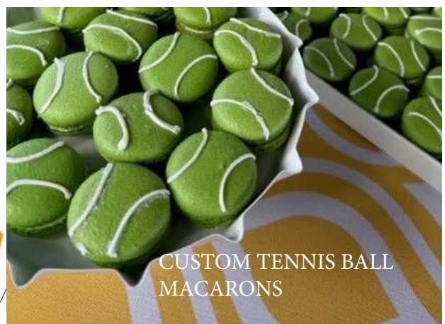
CUSTOM TENNIS BALL MACARONS