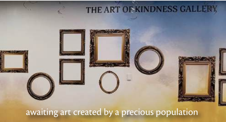
awaiting art created by a precious population

October brought a gorgeous wedding weekend at Sleepy Hollow Country Club in New York, a 40th Anniversary celebration of Empire Loan Pawnbrokers, an inspirational Halloween-themed fundraising walk for Shriners Children's Boston, and a celebration of the successes and impact of Mass Audubon with their members and supporters. And that was just October. November featured an incredible wedding weekend celebrated with two very special families and their guests in the gorgeous Four Seasons Hotel Boston. While each event was so different, they all shared one very important aspect - my attention to every detail, both visual and operational. The settings were each unique and stunning.