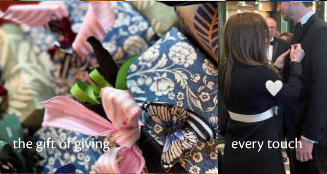
the gift of giving