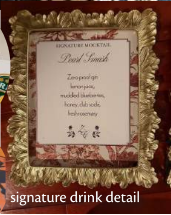
signature drink detail

I get such a thrill out of creating accessories and touches that really capture the essence of an event and bring additional meaning as well as guest interest. Scale is important - guests love precious pieces that surprise and delight.